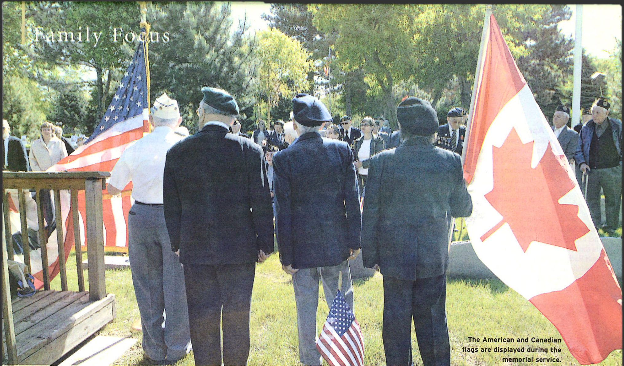
The American and Canadian flags are displayed during the memorial service.