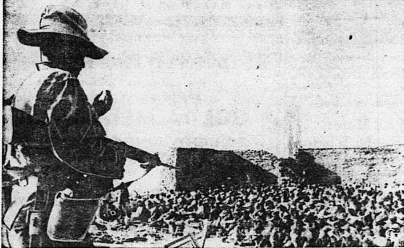
Egyptian prisoners in the Gaza Strip (upper photo) line up, hands clasped over their heads, as those in foreground remove their shoes. In the lower photo, at another spot in the Gaza Strip, the beaten Egyptians are shown seated in a compound under Israeli guard.